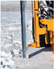
Bottom Guide secures Pile - Custom sizes and shapes available.