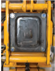
Removable adapter plate, shown above. Custom sizes and shapes available.