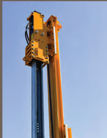
Accommodates guardrail posts (piles) up to 8.5' (2.6m) tall.