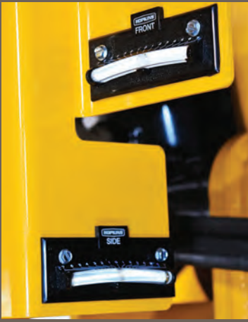
Two quick-read, numbered, leveling indicators to plumb posts.