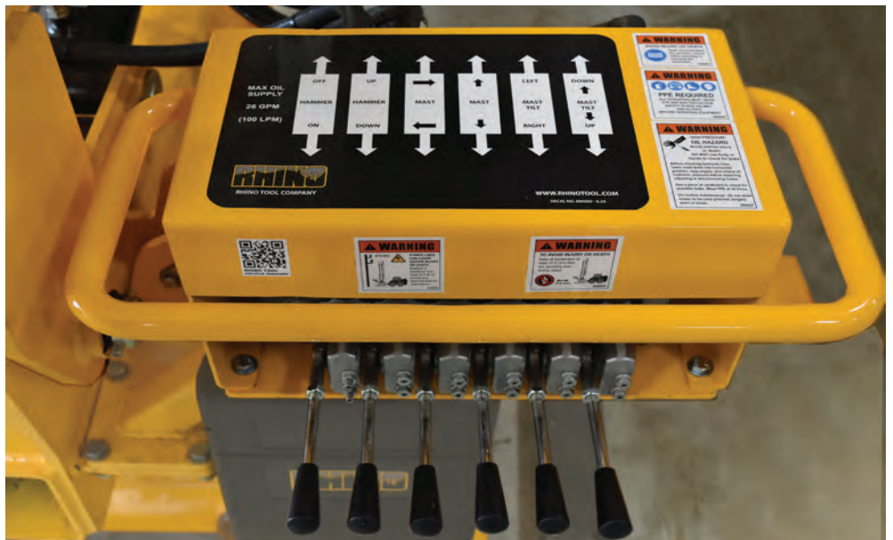
Omni Directional Adjustment for precise positioning and leveling of the pile and to accommodate for Uneven Terrain