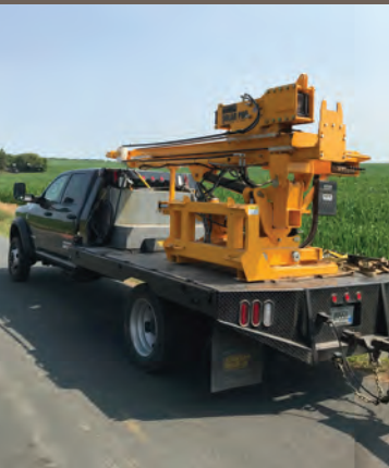
Easily transport company owned, or rental, hydraulic operated equipment (skid steer or loader) and CEA.