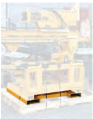
Metal Fork Pallet Kit - Safely transport your CEA with a forklift.

Versatility from one unit - Multiple Adapters to provide efficient driving of piles/post/beam up to a maximum footprint of 8" x 7.25" (20.3 x 18.4cm), and maximum height of 8.5' (21.59 cm) tall.