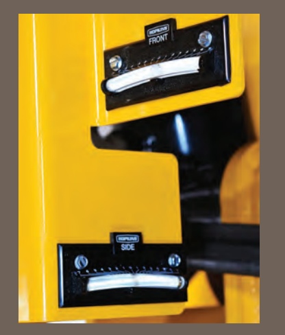
Two quick-read, numbered, leveling indicators to plumb posts.