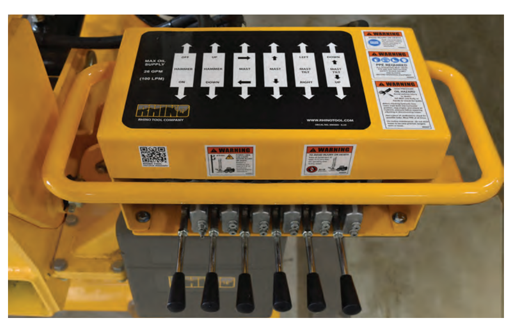
Omni Directional Adjustment for precise positioning and leveling of the pile and to accommodate for Uneven Terrain