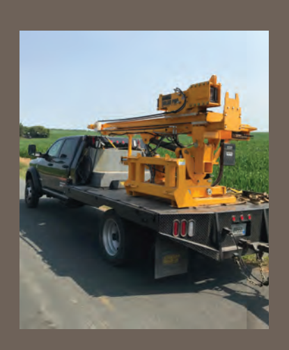
Easily transport company owned, or rental, hydraulic operated equipment (skid steer or loader) and CEA.