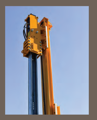
Accommodates guardrail posts (piles) up to 8.5' (2.6m) tall.