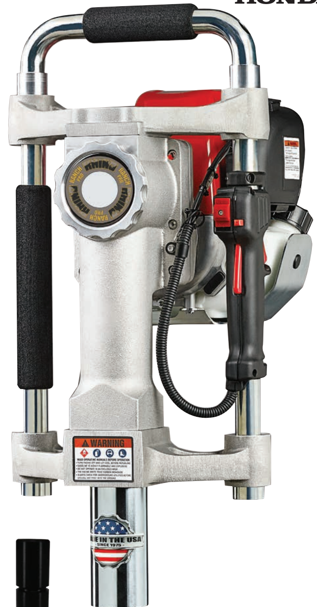
Ranch Pro Post Driver includes 1" adapter Model No. 300001