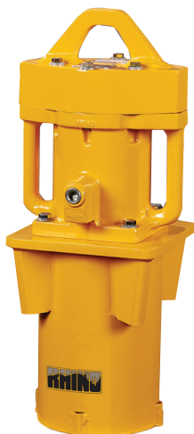
070758 7" Master Chuck included on driver