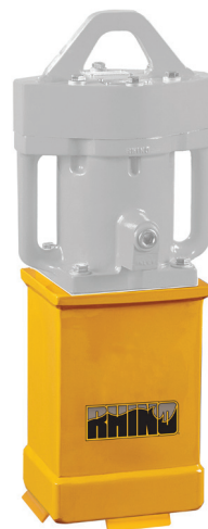
070761 6" x 6" Master Chuck Drives 6" x 6" Wood Post

Quick Chuck change instructions on box make switching the Master Chuck Easy