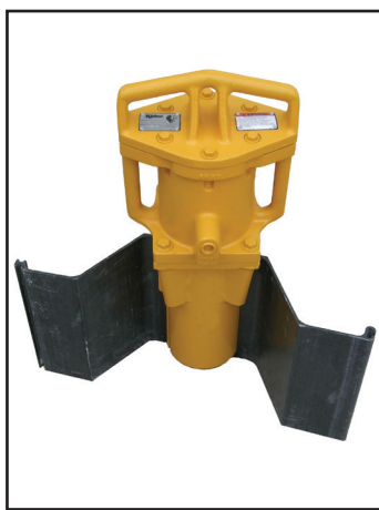
Driver shown with sheet pile inserted into chuck.