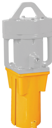
070597 Slotted Sheet Pile Chuck