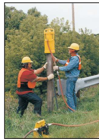
6" x 6" Master Chuck (P/N 070761) Attached for square wood pile.