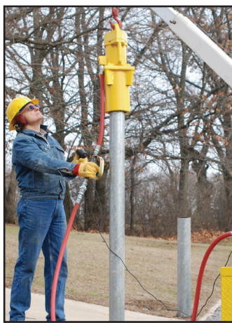
7" Master Chuck (P/N 070756) Driving Steel Post