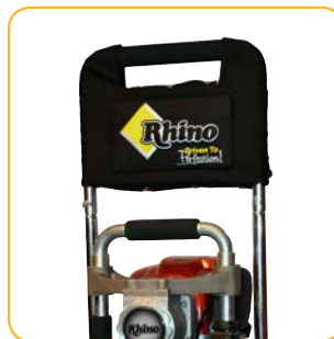
Durable canvas bag attached for storage.