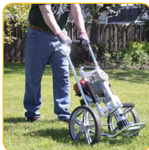
Large wheels for easy maneuvering on all types of terrain.