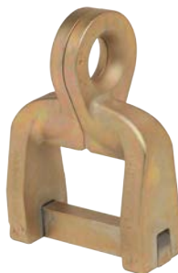
071040 Post Grabber Sold Separately