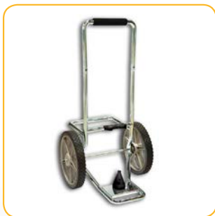
Part No. 290000