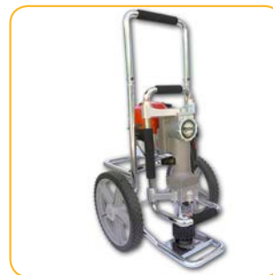
Zinc plated throughout for corrosion resistance.