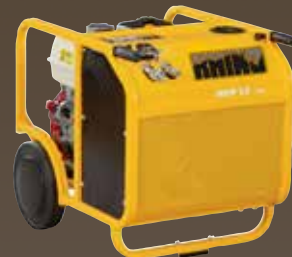
Rhino® HPP 13 Flex