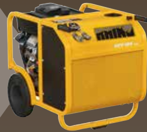
Rhino® HPP 18 V Flex