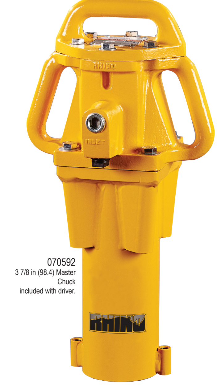
Bolt-on adapters sold separately.

A Tradition of Quality and Service Since 1975