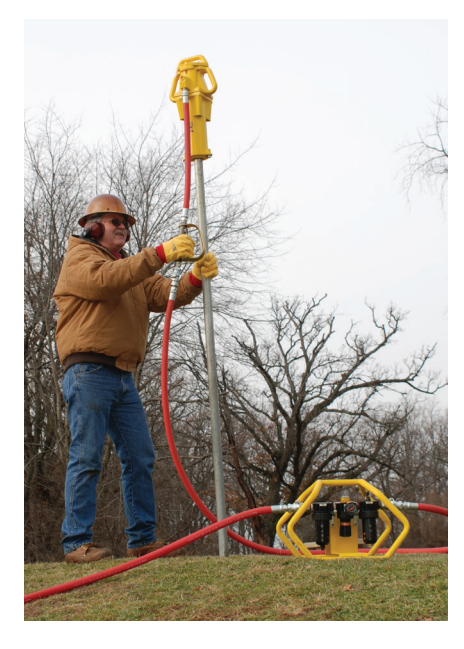
PD-55 shown with FRL and Carrier.